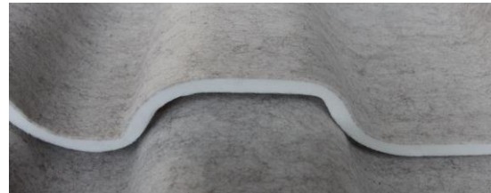
Detailed view of test specimen.